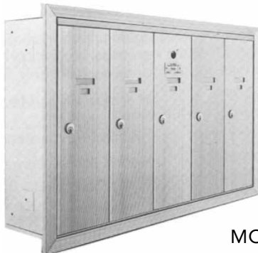
MODEL 9040-5 as shown