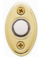
Oval No. 4852