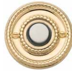
Beaded No. 4850