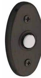
Large Oval No. 4858

Designed to accessorize Baldwin entrance locksets. Solid brass. A brass ring surrounds the plastic push button for added strength and is finished in US4 only.