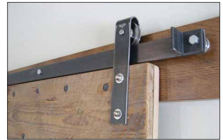
Clear Coat finish, Zinc bolts

To compose a complete order for one 1-3/4" door, the following items are needed: